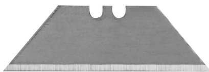
3 UTILITY BLADES INCLUDED