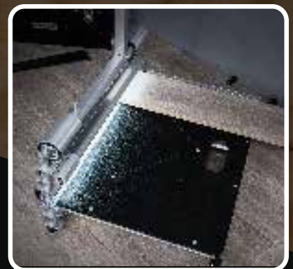
Cutting guide accommodate straight edges or angled cuts