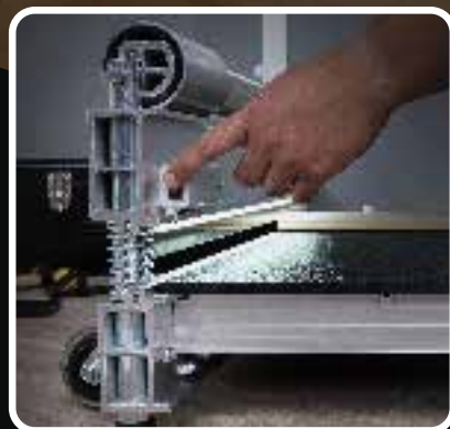
Built-in light for improved cutting view