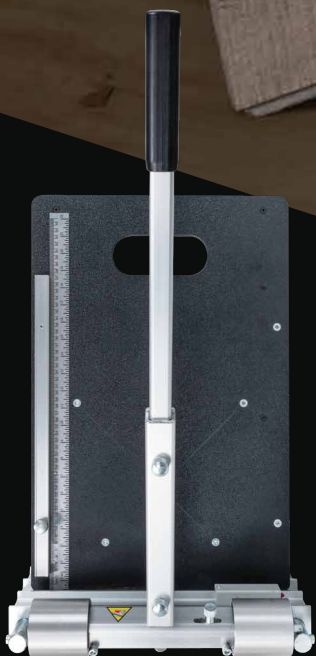
Built-in ruler features both inches and millimeters for convenience