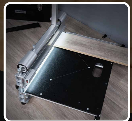
Cutting guide accommodate straight edges or angled cuts