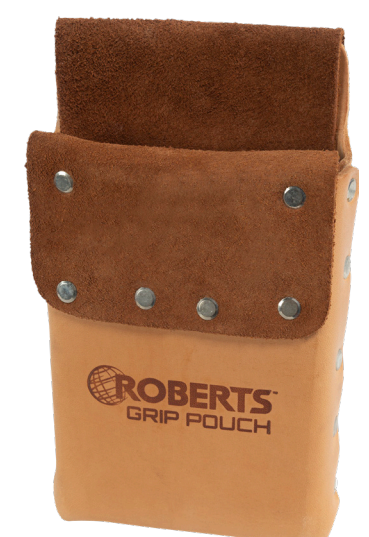
10-260 LEATHER TOOL POUCH