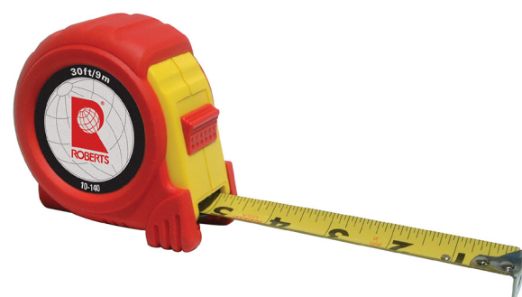
10-140 30 FT. TAPE MEASURE