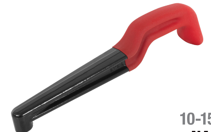
10-151 NAIL DRIVING BAR