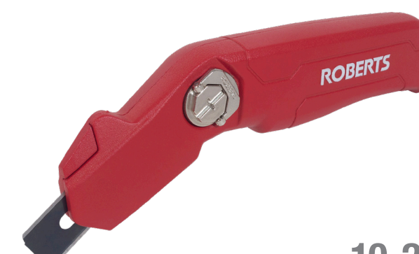
10-259 3-IN-1 CARPET, VINYL AND UTILITY KNIFE