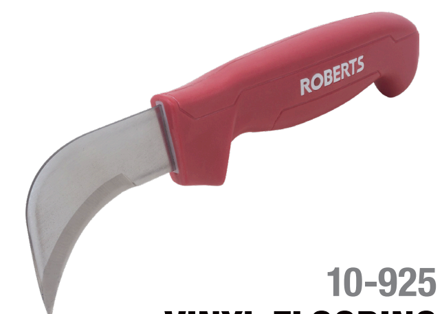
10-925 VINYL FLOORING KNIFE