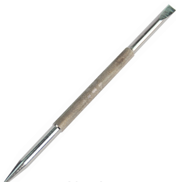
10-517 ROW FINDER