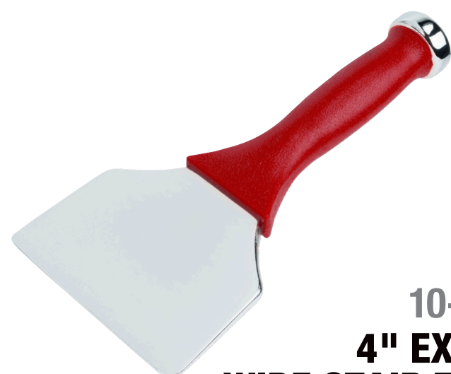
10-521 4" EXTRA WIDE STAIR TOOL