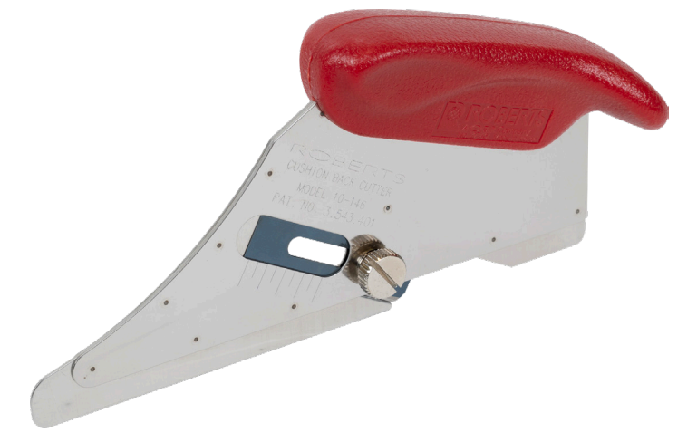
10-146-3 CUSHION BACK CUTTER