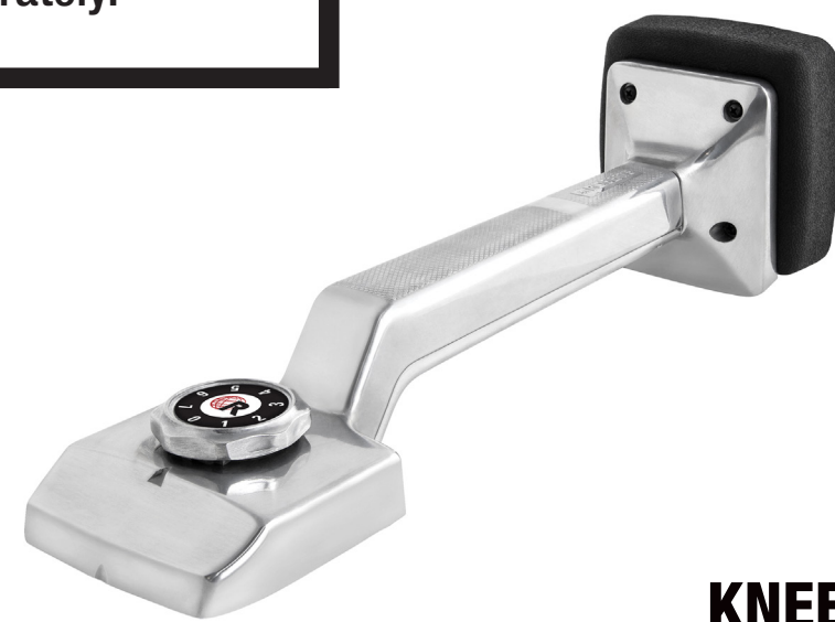
10-412-2 DELUXE KNEE KICKER