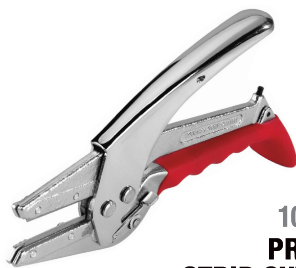
10-108 PRO 2" STRIP CUTTER