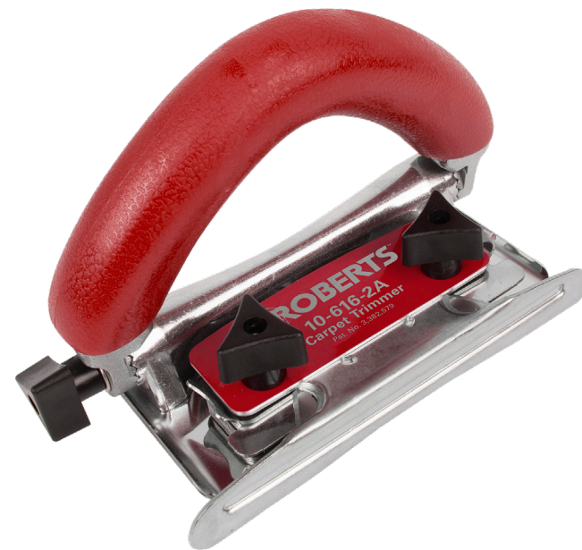
10-616-2A CONVENTIONAL CARPET TRIMMER

This kit includes 22 tools, conveniently packed in a 24" steel tool box. It's an economical alternative to purchasing each item separately.