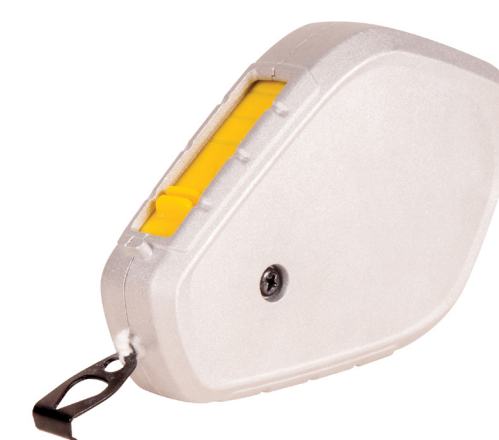
10-303S CHALK REEL