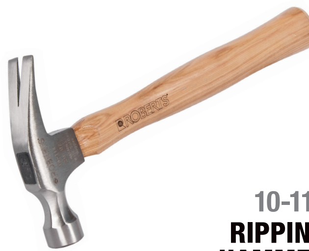
10-114 RIPPING HAMMER