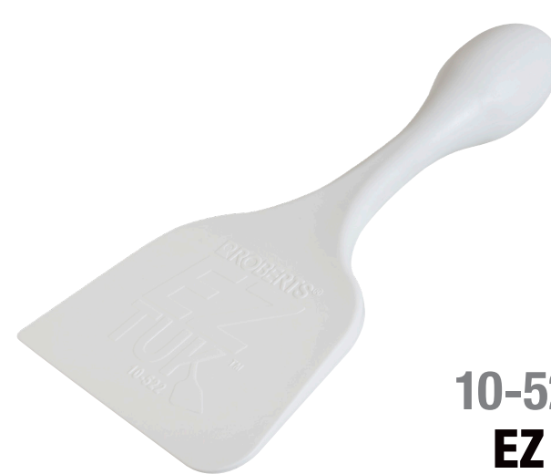
10-522-4 EZ TUK CARPET TUCKER