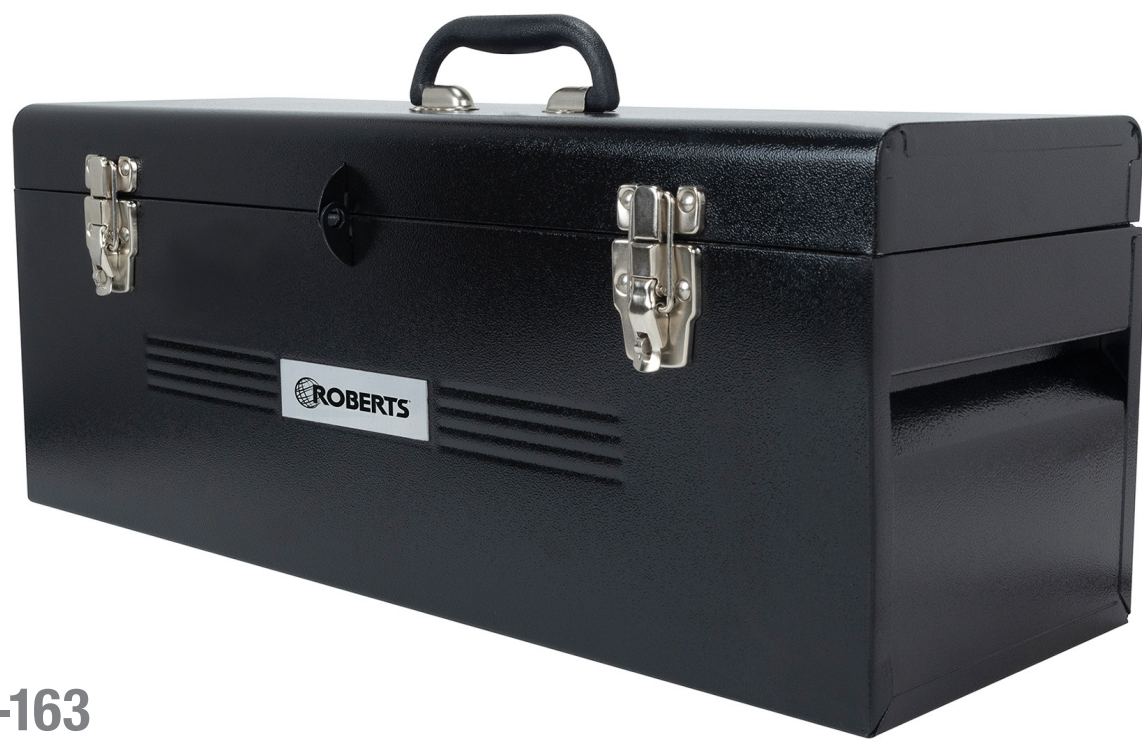
10-163 24" STEEL TOOL BOX

This kit includes 22 tools, conveniently packed in a 24" steel tool box. It's an economical alternative to purchasing each item separately.