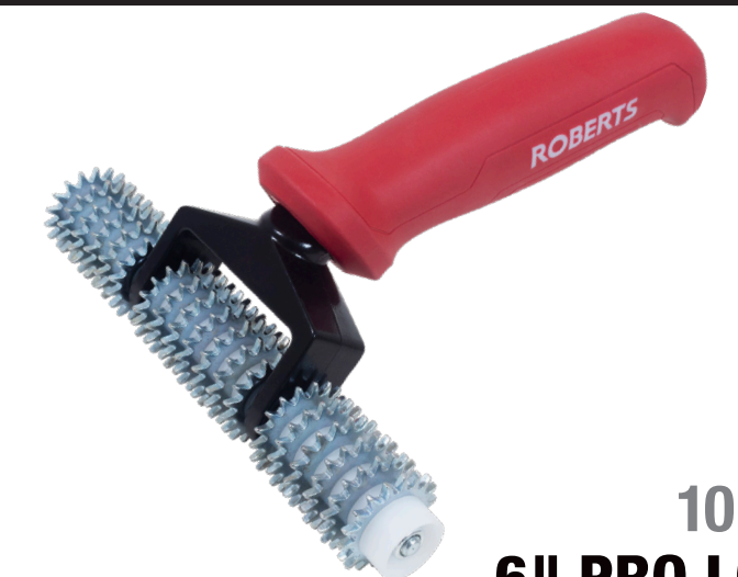
10-122 6" PRO LOOP PILE CARPET SEAM ROLLER