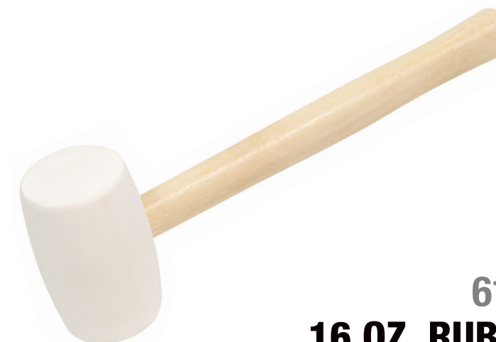
61613 16 OZ. RUBBER MALLETT