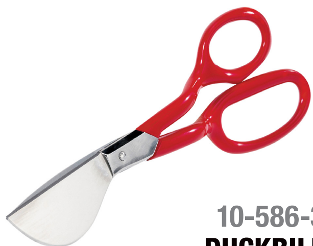
10-586-3 DUCKBILL NAPPING SHEARS