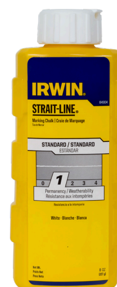
WHITE CHALK REFILL 8 OZ.