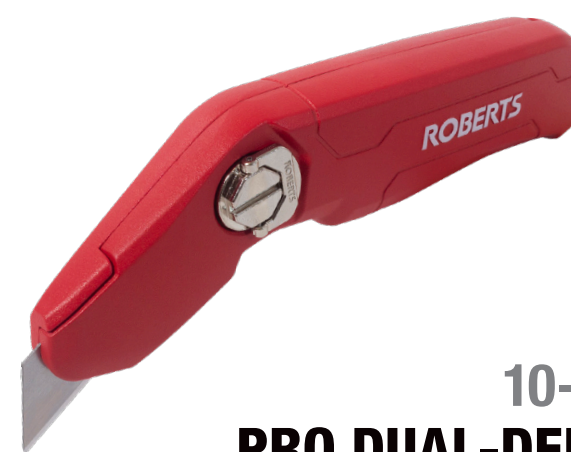
10-216 PRO DUAL-DEPTH CARPET KNIFE