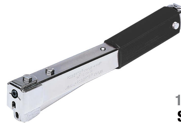
10-109 STEEL STAPLE HAMMER