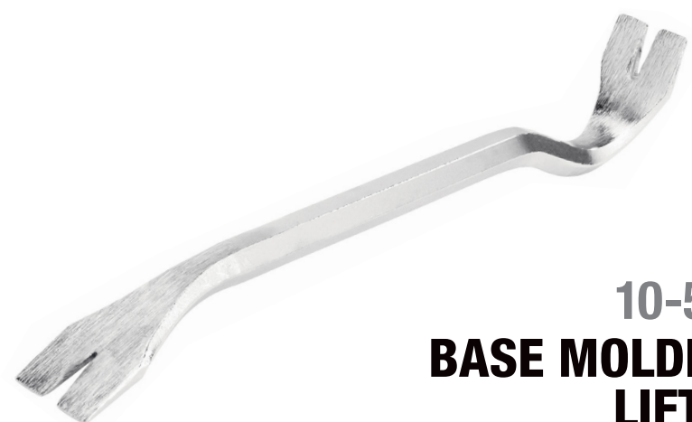
10-503 BASE MOLDING LIFTER